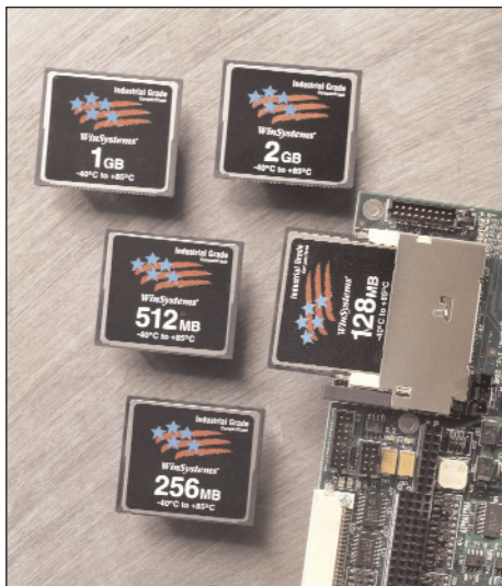
WinSystems' Industrial CompactFlash

WinSystems offers industrial-grade CompactFlash cards that can be used to boot and store data like a solid state disk drive while operating from -40° to +85°C for high capacity, harsh embedded applications. The sustained data transfer rate is very fast, plus an on-card wear leveling algorithm extends the number of write cycles to the part. These RoHS-compliant cards will fit into any computer, SBC, or instrument with a CompactFlash socket. For more information, go to www.industrialcompactflash.com